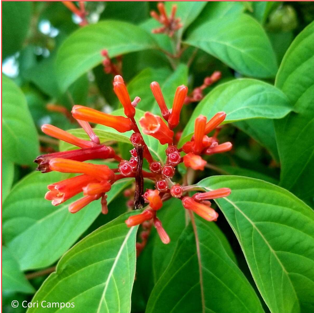
Firebush - Hamelia patens

Firebush ( Hamelia patens ) is a large, perennial shrub that can grow to 15' tall and 8' wide. Distinguished from its Caribbean and Central American cousins that have yellow or orange flowers, our native firebush has red, tubular flowers that attract bees, butterflies, moths, and hummingbirds. Its fruit attracts a number of songbirds including wood thrush and mockingbirds.