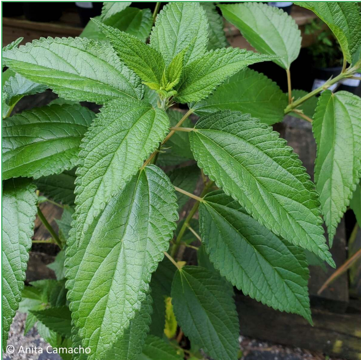
False-nettle - Boehmeria cylindrica

False-nettle ( Boehmeria cylindrica ) is a short-lived, 1-3' perennial herb in the Urticaceaea (nettle) family whose native habitat includes cypress swamps, floodplain forests, wet thickets, stream banks, marshes, wet prairies and margins of ponds. It is also characteristically found in ditches and disturbed places. With insignificant, tiny whitish-green flowers that appear on spikes in the summer and late fall, this plant's interesting foliage makes it a