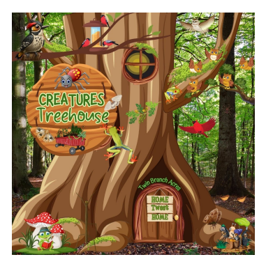
JULY 8 - 12