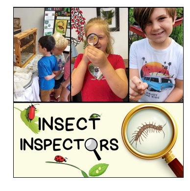
AUGUST 5 - 9