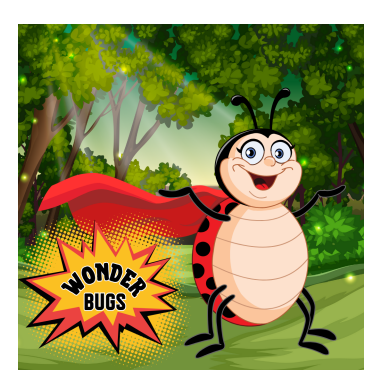
JUNE 10 - 14