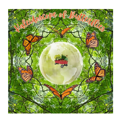
JUNE 17 - 21