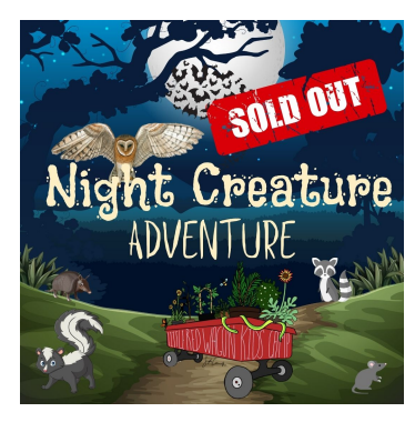
JULY 29 - AUG. 2