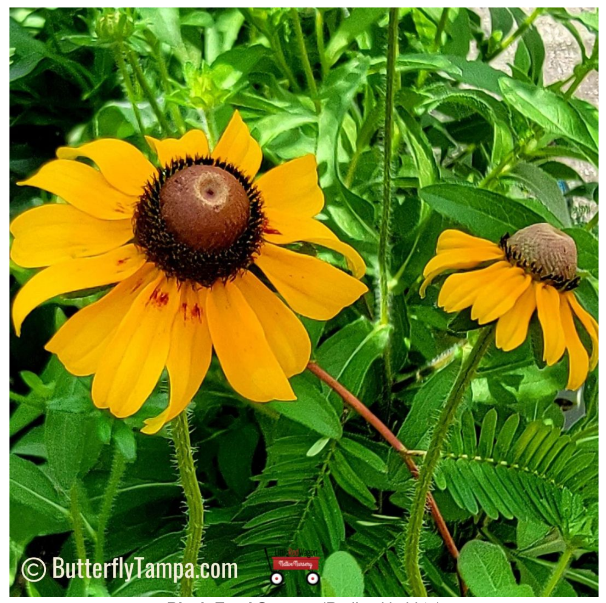
Black-Eyed Susan - (Rudbeckia hirta)

Black-Eyed Susan ( Rudbeckia hirta ) is perhaps the most recognizable of our native plants. With 3-inch wide flowers that have golden-yellow petals and a dark chocolate brown center, this wonderful plant is a hallmark of prairies, wildflower meadows, and roadside plantings. A biennial that readily self-seeds, Black-Eyed Susans will easily grow to 3 feet tall and about 2 feet wide. In Florida, this plant typically blooms from spring through summer. It's a favorite nectar source for our native pollinators including bees, moths, and butterflies. It is the host plant for Silvery Checkerspot caterpillars; Silvery Checkerspots are found in the extreme northern parts of Florida.