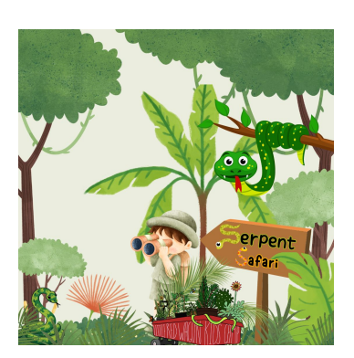
JULY 15 - 19