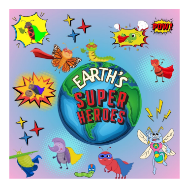
JULY 1-3 & 5