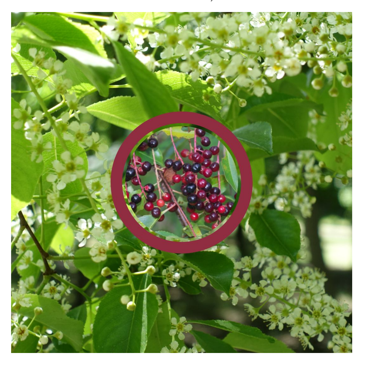
Black Cherry - (Prunus serotina)

Black Cherry ( Prunus serotina ) is a deciduous tree that typically grows 60 to 90 feet tall and 35 to 50 feet wide here in Florida. With long, dangling clusters of delicate, white fragrant spring blossoms that become dark purple berries in the fall, this plant is the caterpillar host plant for the Eastern Tiger Swallowtail and Red-Spotted Purple. Its blossoms provide abundant nectar to our native pollinators and its berries are a wonderful source of late fall and winter food for birds and small mammals.