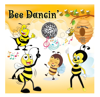
JUNE 24 - 28