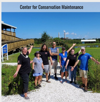
Center for Conservation Maintenance

Keep visiting our website for upcoming dates.