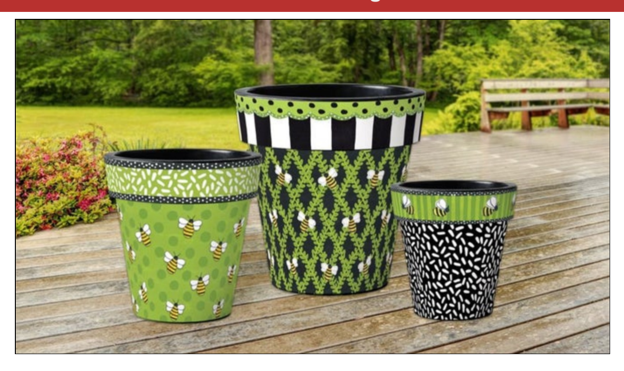
Bee Inspired: August 15 & 17 - National & World Bee Days