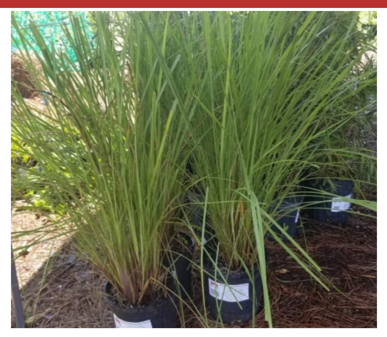
Dwarf Fakahatchee grass (Tripsacum floridanum)

<u>Dwarf Fakahatchee grass</u> ( Tripsacum floridanum ) is a perennial grass in the Poaceae family whose native habitat includes pine rocklands and marl prairies. The plant forms dense, upright clumps that are 4-6 feet wide and 2-3 feet tall (up to 4 feet when it flowers with showy, rust-colored spikes). Its somewhat narrow blades pair well with <u>coreopsis</u> ( Coreopsis spp. ) and <u>tropical sage</u> ( Salvia coccinea ) and it also looks great in mass plantings or as a filler in planters. Able to withstand moist soil as well as drought conditions, this grass prefers full sun and makes an outstanding addition to almost any garden. Importantly, this grass is an important food source for our Byssus Skipper caterpillars and its seeds are food for birds.