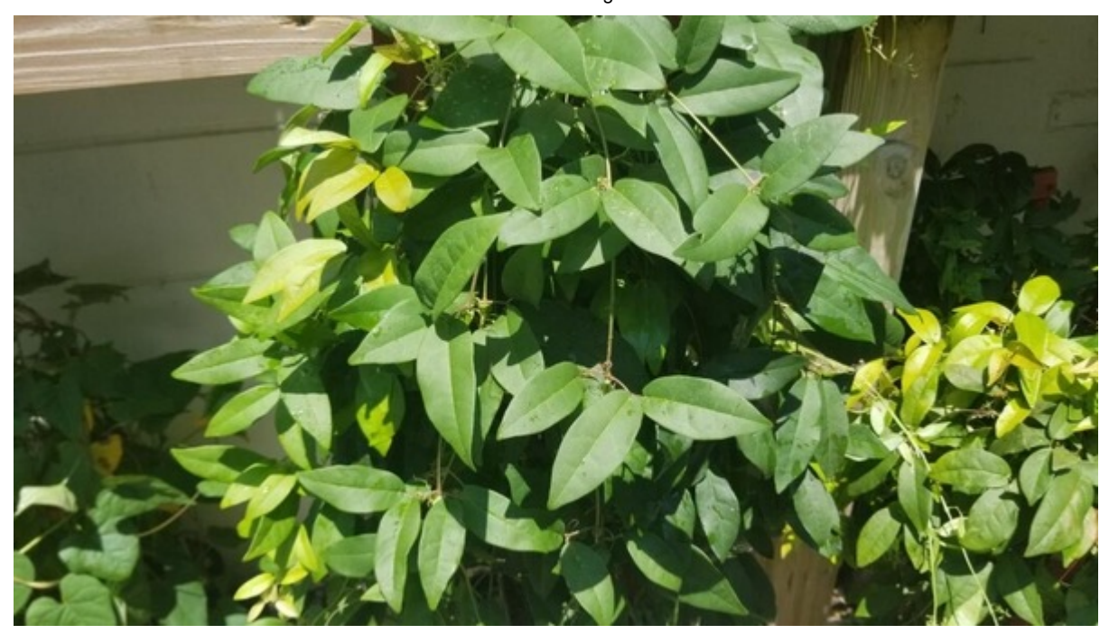
Crossvine (Bignonia capreolata)

<u>Crossvine</u> ( Bignonia capreolata ) is a vigorous vine that can easily grow 30-50 feet tall and almost 10 feet wide. It has beautiful, 1-3 inch trumpet-shaped flowers that can be yellow, orange, or red. In our area, Crossvine normally blooms in late winter and throughout spring on new wood in clusters of 2 to 5 flowers. A true favorite of hummingbirds, this flowering vine is also a great nectar source for butterflies and bees.