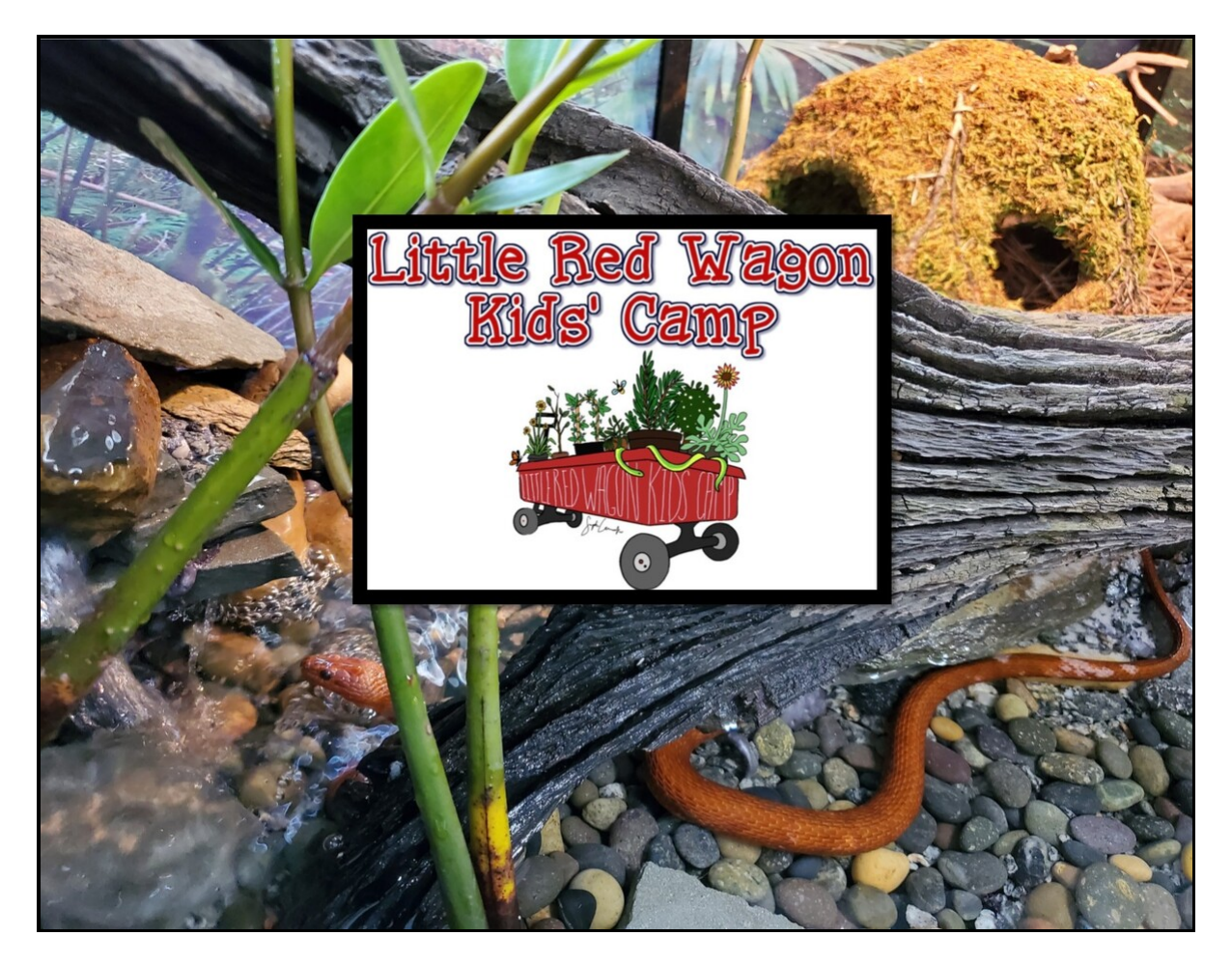
Summer Fun at Little Red Wagon Kids' Camp

Talley, our Red mangrove salt marsh snake, is looking forward to meeting new campers this summer. There's still a few spots before camp ends on August 6, so register before the programs get filled.