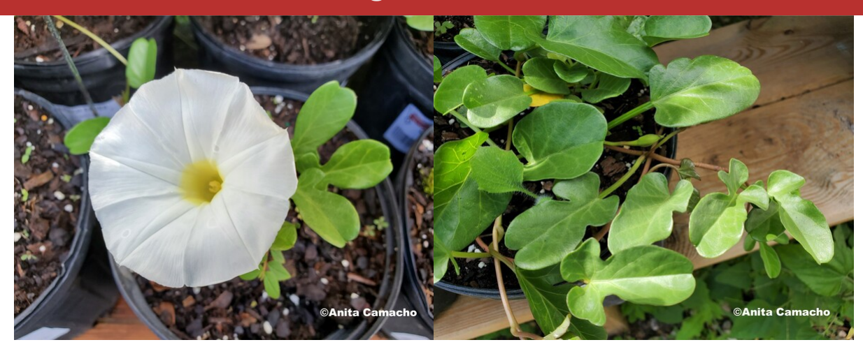
Beach Morning Glory (Ipomoea imperati)

Beach morning glory ( Ipomeoea imperati ) is a 10-20 foot long creeping evergreen vine with showy white flowers that is rarely is more than 6 inches tall. Native to coastal dunes, this plant is a great ground cover for sandy sites with full sun and room to sprawl. The plant tolerates drought and withstands both salty wind and salt spray, making it particularly useful for dune restoration efforts or properties close to salt water.