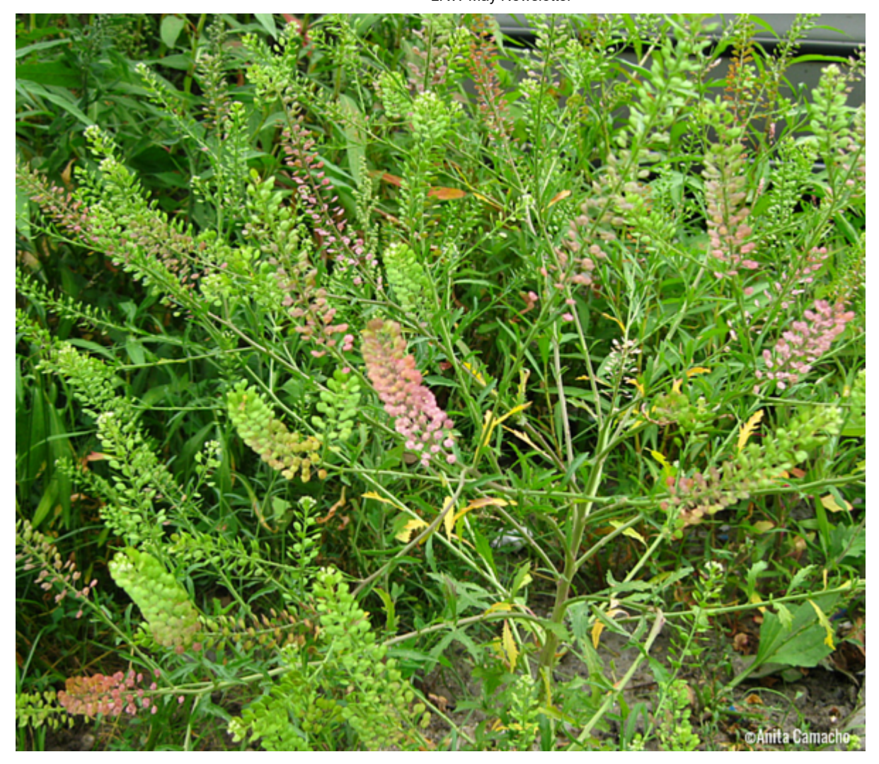
Virginia Pepperweed - Lepidium virginicum

Virginia Pepperweed ( Lepidium virginicum ) is a host plant for the Great Southern White butterfly. Another Florida native plant that is very important for wildlife - and we can eat it also. This is another native plant to have/leave in your garden to attract a beautiful butterfly to your garden. The young leaves can be used as a potherb, sautéed or used raw, such as in salads. The young seedpods can be used as a substitute for black pepper. The leaves contain protein, vitamin A and vitamin C. It prefers sunny locales with dry soil (sounds like Florida to me).