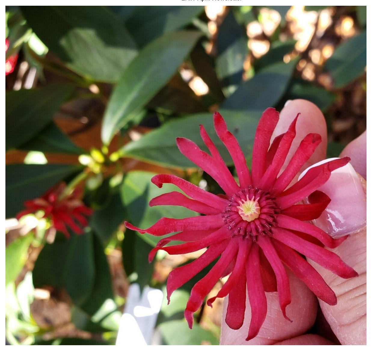
Florida Anise – Illicium floridanum

This is a rapid-growing, spring-blooming, low-maintenance evergreen shrub with spectacular dark glossy green foliage that is a very dependable shrub in the Florida shady landscape. Its red blooms in the spring are followed by star-shaped seed pods which cling to the stems. The leaves give off a lush anise fragrance when bruised or crushed. You can propagate this plant from cuttings or seeds (seeds come from a pretty star shaped pod). It can grow 10'- 15' tall with a 6'-10' spread in width. Plant this in a damp shady area and enjoy the Florida shade in the springtime while enjoying this beautiful bloomer!